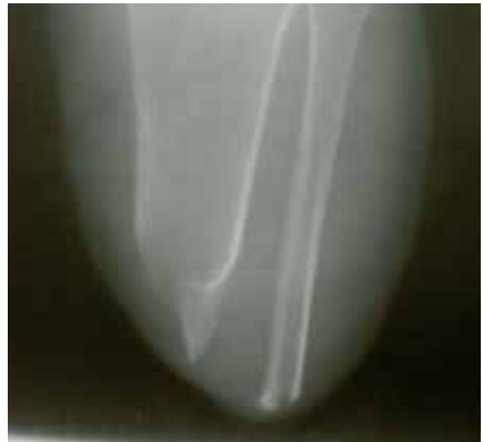
Figure 11. Osteophyte formation on the tibia, and overly long fibula causing pain and stump erosion in a BKA patient.