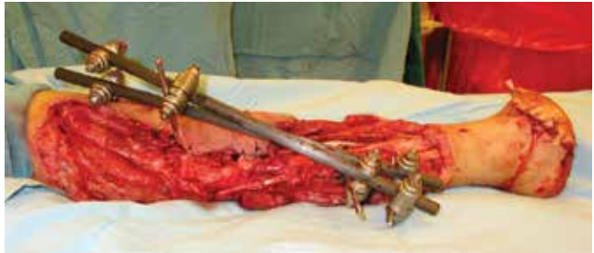
Figure 9. In the event of mangled extremities (or beyond classification trauma), proximal and distal injuries should be dealt with separately whenever possible (Bar-On)