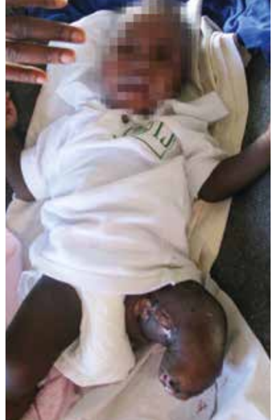
Figure 8. Amputations in children require special attention due to the fact that the bones are often still capable of growth. (Bar-On)