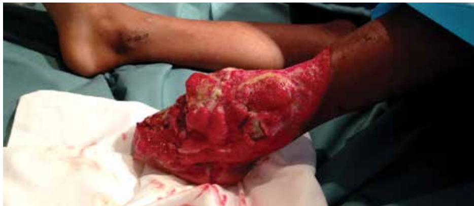
Figure 1. Traumatic Amputation of the left leg (Bar-On)