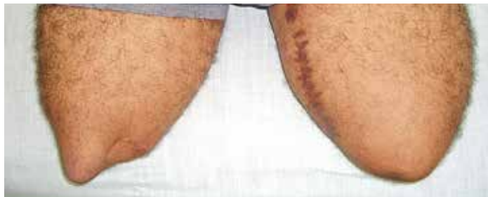
Figure 6. Image demonstrating the importance of good soft tissue covering. The left stump is well covered, the right is lacking.