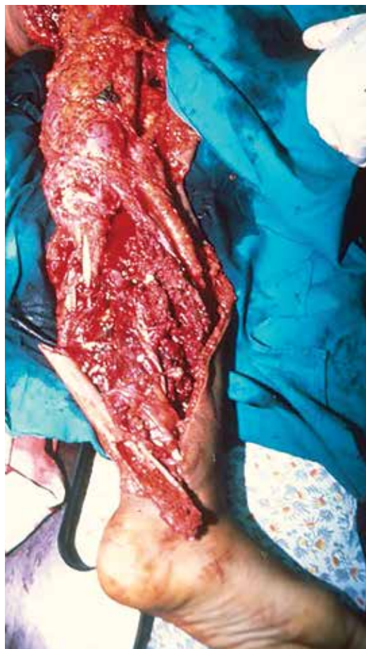
Figure 2. Severe soft tissue damage and open fracture of the lower limb that required amputation ( Bar-On )