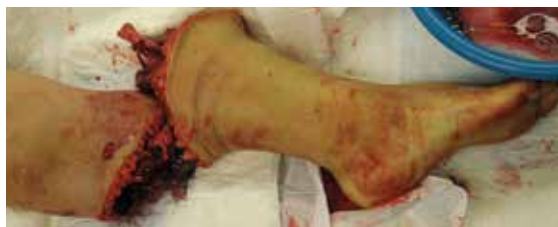
Figure 3. Severe injury with no chance of re-implantation is an indication for amputation. (Bar-On)