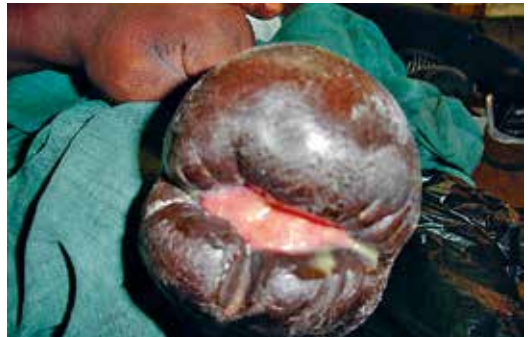
Figure 10. An infection of an amputation stump.