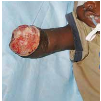
Figure 7. Upper extremity amputation in a young patient . (Bar-On)